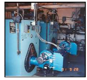
NEW OIL BURNERS