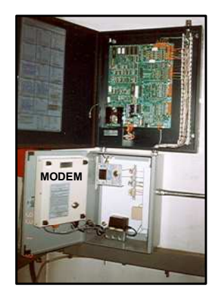
TYPICAL STAND ALONE DIRECT DIGITAL CONTROLLER (DDC) INSTALLED IN ALL REMOTE SITES