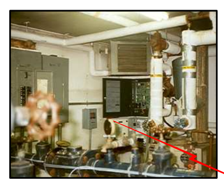
INSIDE NOATAK WATER TREATMENT PLANT