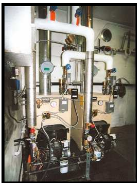
EXAMPLE PROJECT BETHEL, ALASKA 2005

DESIGN AUTOMATIC TEMPERATURE CONTROLS AND ELECTRICAL WIRING FOR BOILERS